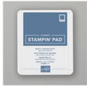
Misty Moonlight Classic Stampin' Pad 153118