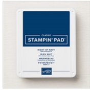
Night Of Navy Classic Stampin' Pad 147110