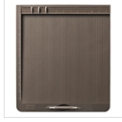
Simply Scored 122334