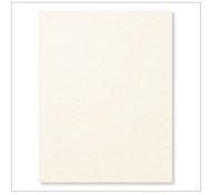
Very Vanilla 8-1/2" X 11" Cardstock 101650