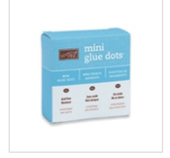
Mini Glue Dots 103683