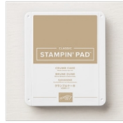
Crumb Cake Classic Stampin' Pad 147116