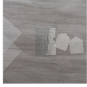
Window Sheets 142314