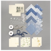
Boho Indigo Product Medley (English) 153132