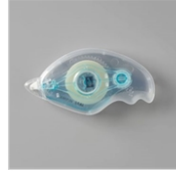
Stampin' Seal 152813