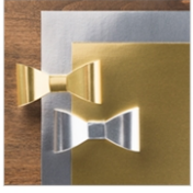
Gold Foil Sheets 132622