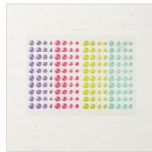
Glitter Enamel Dots 146934