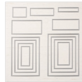
Stitched Rectangle Dies 148551