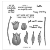
Timeless Tulips Photopolymer Stamp Set (English) 151534