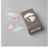
Umbrella Builder Punch 151293