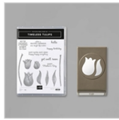
Timeless Tulips Bundle (English) 153793