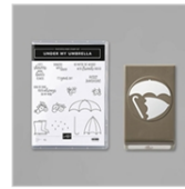
Under My Umbrella Bundle (English) 153786