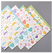
Pleasant As Punch Designer Series Paper 153558