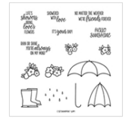
Under My Umbrella Photopolymer Stamp Set (English) 151518