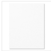
Whisper White 8-1/2" X 11" Cardstock 100730