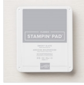
Smoky Slate Classic Stampin' Pad 147113