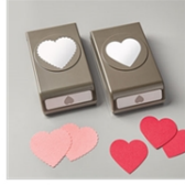
Heart Punch Pack 151292