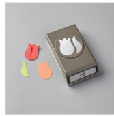
Tulip Builder Punch 151295