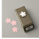
Small Bloom Punch 152316