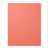
Calypso Coral 8-1/2" X 11" Cardstock 122925