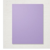
Highland Heather 8- 1/2" X 11" Cardstock 146986