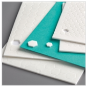
Mini Stampin' Dimensionals 144108