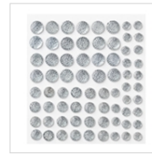
Clear Faceted Gems 144142