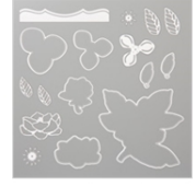
Magnolia Memory Dies 149578