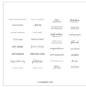
Itty Bitty Greetings Cling-Mount Stamp Set 151331