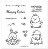
Welcome Easter Cling Stamp Set (English) 151559