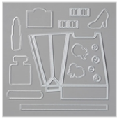
All Dressed Up Dies 151665