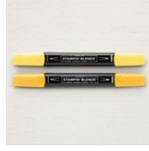
Mango Melody Combo Pack Stampin' Blends 147945