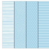
Subtles 6" X 6" (15.2 X 15.2 Cm) Designer Series Paper 146966