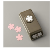
Small Bloom Punch 152316