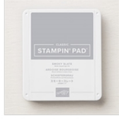
Smoky Slate Classic Stampin' Pad 147113