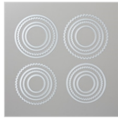
Layering Circles Dies 151770