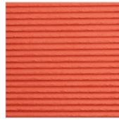
Corrugated 3D Embossing Folder 151811