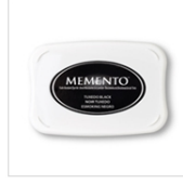
Tuxedo Black Memento Ink Pad 132708