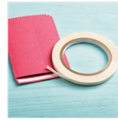
Tear & Tape Adhesive 138995