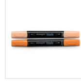
Pumpkin Pie Stampin' Blends Markers Combo Pack 144599