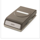
Classic Label Punch 141491