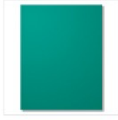
Tranquil Tide 8-1/2" X 11" Cardstock 144246