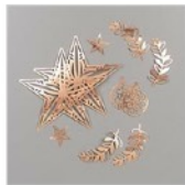
Brightly Gleaming Foil Elements 150431