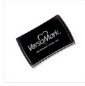
Versamark Pad 102283