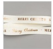
Very Vanilla/Copper 1/2" (1.3 Cm) Classic Weave Ribbon 150394