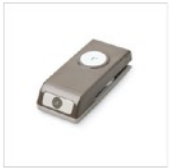
1" (2.5 Cm) Circle Punch