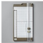
Paper Trimmer 152392