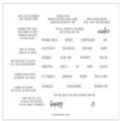
A Wish For Everything Cling Stamp Set 149320