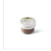
Copper Stampin' Emboss Powder 141636