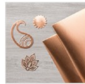
Copper Foil Sheets 142020