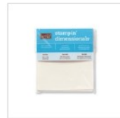
Stampin' Dimensionals 104430