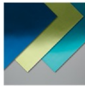
Noble Peacock Foil Sheets 149495