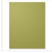
Old Olive 8-1/2" X 11" Cardstock 100702