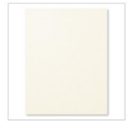
Very Vanilla 8-1/2" X 11" Cardstock 101650