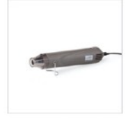
Heat Tool (Us And Canada) 129053