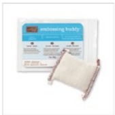
Embossing Buddy 103083