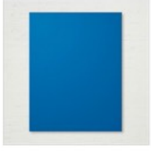
Blueberry Bushel 8- 1/2" X 11" Cardstock 146968