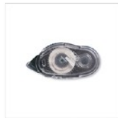
Snail Adhesive 104332