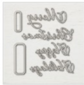
Merry Christmas Dies 147912