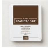
Early Espresso Classic Stampin' Pad 147114