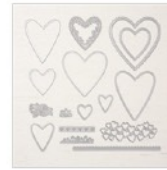
Stitched Be Mine Dies 148527