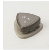
Detailed Trio Punch 146320