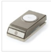
1-1/2" (3.8 Cm) Circle Punch 138299