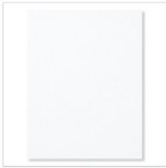
Whisper White 8-1/2" X 11" Cardstock 100730