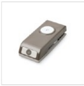
1" (2.5 Cm) Circle Punch 119868