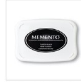
Tuxedo Black Memento Ink Pad 132708