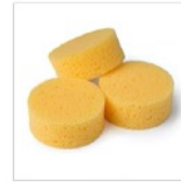
Stamping Sponges 141337