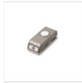
1/2" (1.3 Cm) Circle Punch 119869