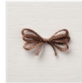
1/4" Copper Trim 144179