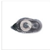
Snail Adhesive 104332