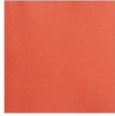
Subtle 3D Embossing Folder 151775