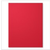
Real Red 8-1/2" X 11" Cardstock 102482