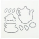
Tea Time Dies 149697