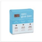
Mini Glue Dots 103683