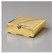
Gold Mini Pizza Boxes 152068