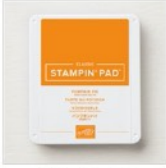
Pumpkin Pie Classic Stampin' Pad 147086