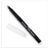
White Stampin' Chalk Marker 132133