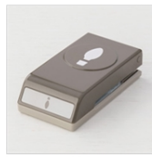
Christmas Bulb Builder Punch 148013