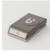
Sprig Punch 148012