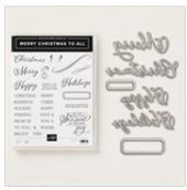
Merry Christmas To All Photopolymer Bundle 149952