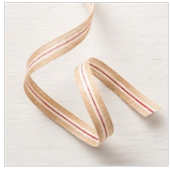
5/8" (1.6 Cm) Striped Burlap Trim 147889