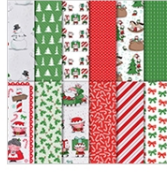
Santa's Workshop 12" X 12" (30.5 X 30.5 Cm) Specialty Designer Series Paper 147809