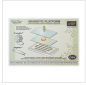
Magnetic Platform 130658