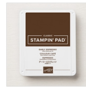
Early Espresso Classic Stampin' Pad 147114