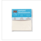
Stampin' Dimensionals 104430