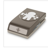
Cookie Cutter Builder Punch 140396