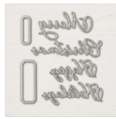
Merry Christmas Thinlits Dies 147912