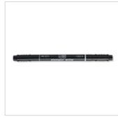
Basic Black Stampin' Write Marker 100082