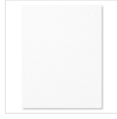
Whisper White 8-1/2" X 11" Cardstock 100730