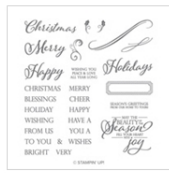
Merry Christmas To All Photopolymer Stamp Set 147702