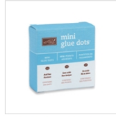
Mini Glue Dots 103683