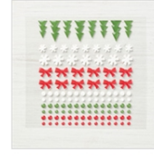
Santa's Workshop Enamel Shapes 147811