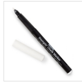
White Stampin' Chalk Marker 132133