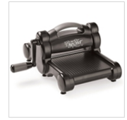
Big Shot 143263