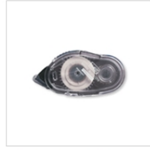
Snail Adhesive 104332