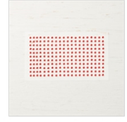
Red Rhinestone Basic Jewels 146924