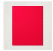
Poppy Parade 8-1/2" X 11" Cardstock 119793