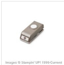
1/2" (1.3 Cm) Circle Punch 119869