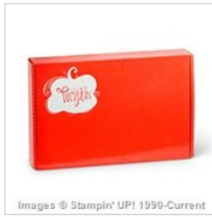
1-Month Prepaid Paper Pumpkin Subscription 137858