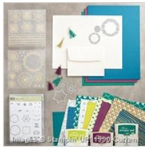
Eastern Palace Premier Bundle 147207