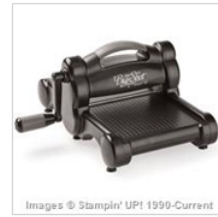
Big Shot 143263