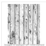
Hardwood Clear- Mount Stamp 133035