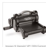
Big Shot 143263