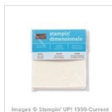
Stampin' Dimensionals 104430