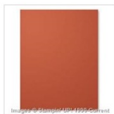
Cajun Craze 8-1/2" X 11" Cardstock 119684