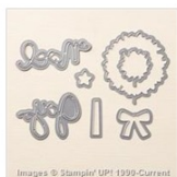
Wonderful Wreath Framelits Dies 135851