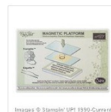
Magnetic Platform 130658