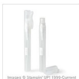
Stampin' Spritzer 126185