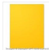
Crushed Curry 8-1/2" X 11" Cardstock 131199