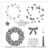
Wondrous Wreath Photopolymer Stamp Set 135047