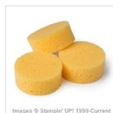
Stamping Sponges 141337