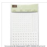
Pearl Basic Jewels 119247