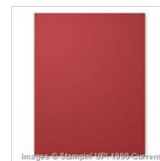
Cherry Cobbler 8-1/2" X 11" Cardstock 119685