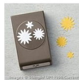
Blossom Bunch Punch 140612