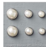
Metal Rimmed Pearls 138394