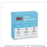
Mini Glue Dots 103683