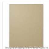
Crumb Cake 8-1/2" X 11" Cardstock 120953