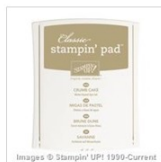
Crumb Cake Classic Stampin' Pad 126975