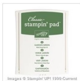
Garden Green Classic Stampin' Pad 126973