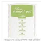
Pear Pizzazz Classic Stampin' Pad 131180