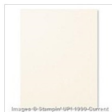
Very Vanilla 8-1/2" X 11" Cardstock 101650