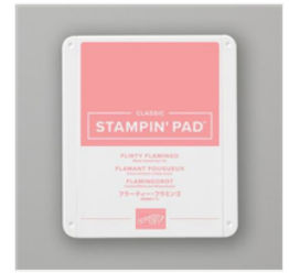
Flirty Flamingo Classic Stampin' Pad - 147052