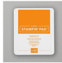
Pumpkin Pie Classic Stampin' Pad - 147086