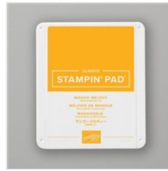
Mango Melody Classic Stampin' Pad - 147093