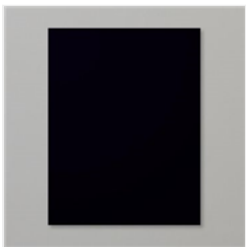
Basic Black 8-1/2" X 11" Cardstock - 121045