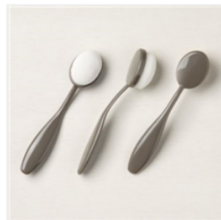
Blending Brushes - 153611