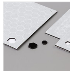
Black Stampin' Dimensionals Combo Pack - 150893