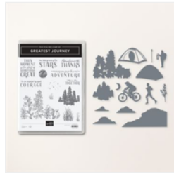
Greatest Journey Bundle (English) - 160594