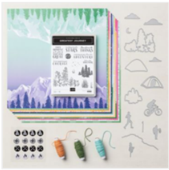
Enjoy The Journey Suite Collection (English) - 160599

Tami White tami@stampwithtami.com www.stampwithtami.com