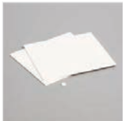
Mini Stampin' Dimensionals - 144108