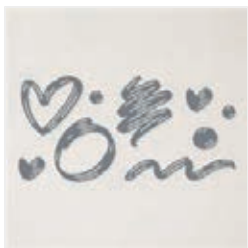
Brushed Shapes Dies - 159177