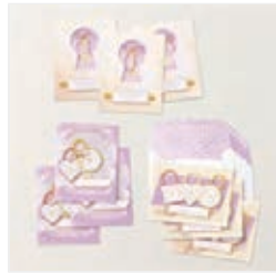
Key to My Heart Paper Pumpkin Refill - 162472