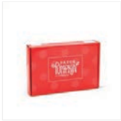
Prepaid Paper Pumpkin Subscription 1-Month - 137858

Tami White tami@stampwithtami.com www.stampwithtami.com