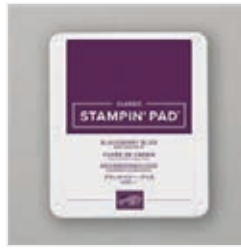
Blackberry Bliss Classic Stampin' Pad - 147092