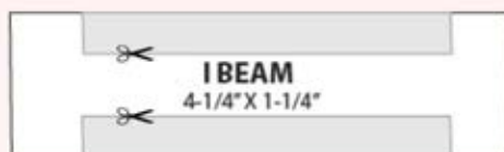
SLIDE HOLDER #1

SLIT 1-1/2 IN FROM THE LEFT EDGE FROM THE BOTTOM CUT FROM 1/2" - 1-1/2"