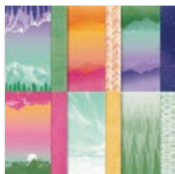
Enjoy The Journey 12" X 12" (30.5 X 30.5 Cm) Designer Series Paper - 160586