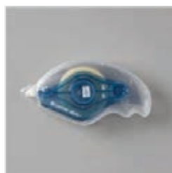
Stampin' Seal+ - 149699