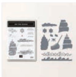
On The Ocean Bundle (English) - 160775

Tami White tami@stampwithtami.com www.stampwithtami.com