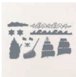
On The Ocean Dies - 160774