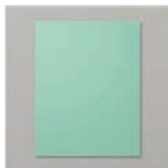
Coastal Cabana 8- 1/2" X 11" Cardstock - 131297