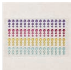
Glossy Dots Assortment - 158827