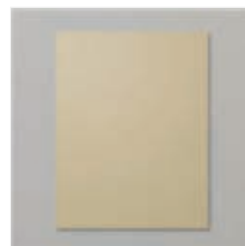
Crumb Cake 8-1/2" X 11" Cardstock - 120953