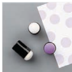
Sponge Daubers - 133773