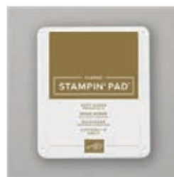
Soft Suede Classic Stampin' Pad - 147115