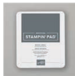
Basic Gray Classic Stampin' Pad - 149165