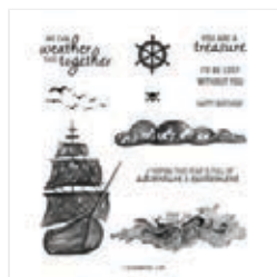
On The Ocean Cling Stamp Set (English) - 160772