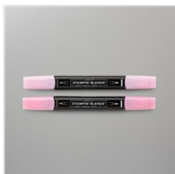
Flirty Flamingo Stampin' Blends Combo Pack - 154884