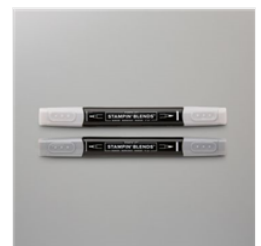
Smoky Slate Stampin' Blends Combo Pack - 154904