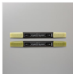
Old Olive Stampin' Blends Combo Pack - 154892