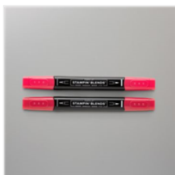
Real Red Stampin' Blends Combo Pack - 154899