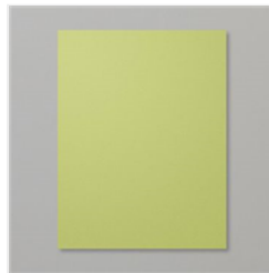
Pear Pizzazz 8- 1/2" X 11" Cardstock - 131201