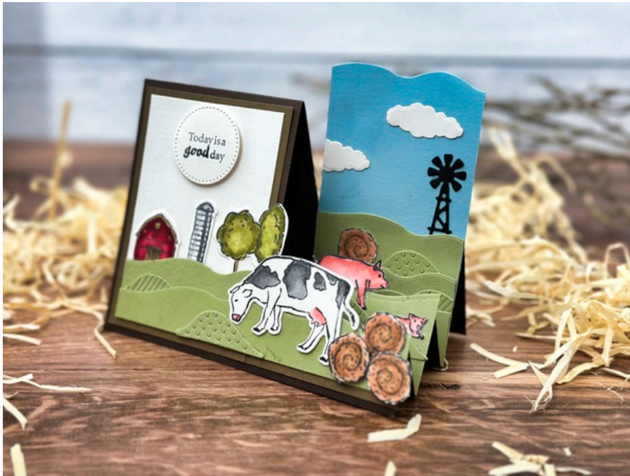
See template and video for how to make this fold.