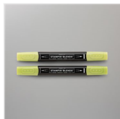
Granny Apple Green Stampin' Blends Combo Pack - 154885