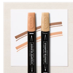
Stampin' Blends Medium Combo - 159462