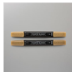
Soft Suede Stampin' Blends Combo Pack - 154906