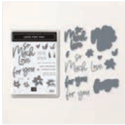
Love For You Bundle (English) - 160406

Tami White tami@stampwithtami.com www.stampwithtami.com