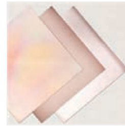
Rose Gold 12" X 12" (30.5 X 30.5 Cm) Specialty Paper - 159139