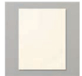
Very Vanilla 8-1/2" X 11" Thick Cardstock - 144237