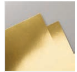
Gold Foil Sheets - 132622