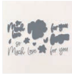
Love For You Dies (English) - 160403