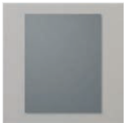
Basic Gray 8-1/2" X 11" Cardstock - 121044