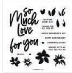
Love For You Photopolymer Stamp Set (English) - 160398