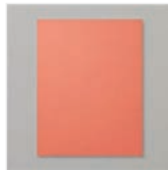
Calypso Coral 8- 1/2" X 11" Cardstock - 122925