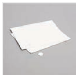
Stampin' Dimensionals - 104430