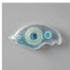
Stampin' Seal - 152813