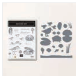
Seaside Bay Bundle (English) - 160445