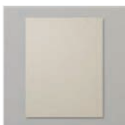
Sahara Sand 8- 1/2" X 11" Cardstock - 121043