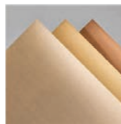
Brushed Metallic Cardstock - 153524