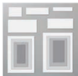
Rectangle Stitched Dies - 151820