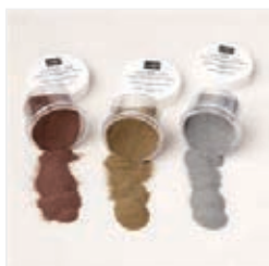
Metallics Embossing Powders - 155555