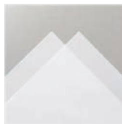
Vellum 8-1/2" X 11" Cardstock - 101856