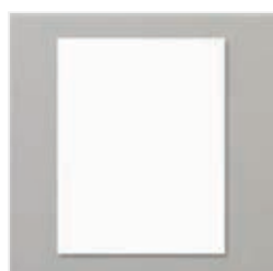
Basic White 8-1/2" X 11" Cardstock - 159276