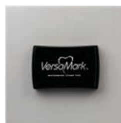
Versamark Pad - 102283