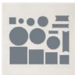
Stylish Shapes Dies - 159183