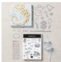
By The Bay Suite Collection (English) - 160450

Tami White tami@stampwithtami.com www.stampwithtami.com