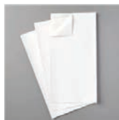
Adhesive Sheets - 152334