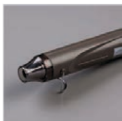
Heat Tool - 129053