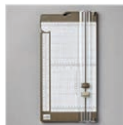
Paper Trimmer - 152392