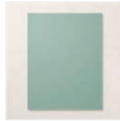
Soft Succulent 8-1/2" X 11" Cardstock - 155776