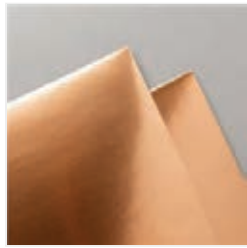
Copper Foil Sheets - 142020