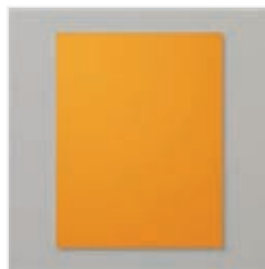
Pumpkin Pie 8-1/2" X 11" Cardstock - 105117