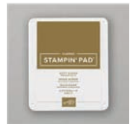
Soft Suede Classic Stampin' Pad - 147115