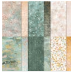
Texture Chic 12" X 12" (30.5 X 30.5 Cm) Specialty Designer Series Paper - 158808