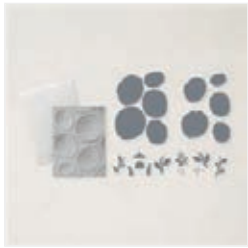
Tree Rings Hybrid Embossing Folder - 159888

Tami White tami@stampwithtami.com www.stampwithtami.com