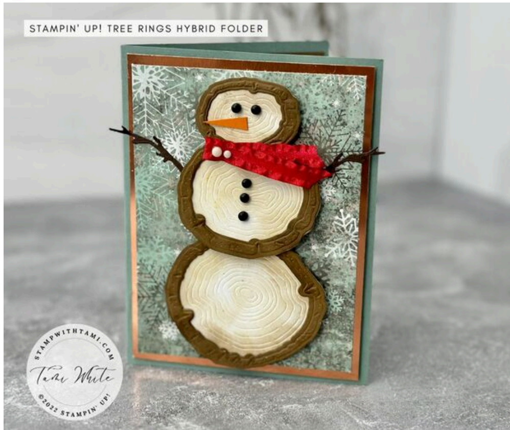
Adorable snowman card created with the Stampin' Up Tree Rings Hybrid Embossing Folder. See my video short and photos below for tips with the folder and dies.