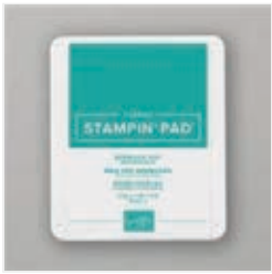
Bermuda Bay Classic Stampin' Pad - 147096

Tami White tami@stampwithtami.com www.stampwithtami.com