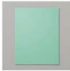
Coastal Cabana 8- 1/2" X 11" Cardstock - 131297