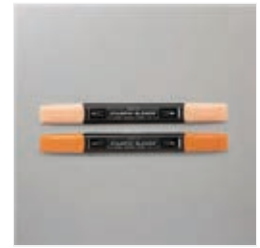
Pumpkin Pie Stampin' Blends Combo Pack - 154897