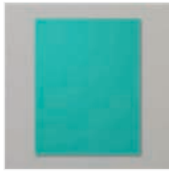
Bermuda Bay 8- 1/2" X 11" Cardstock - 131197