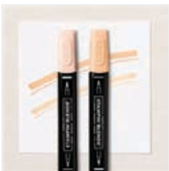
Pale Papaya Stampin' Blends Combo Pack - 155519