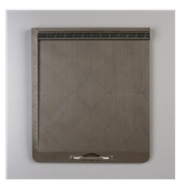
Simply Scored Scoring Tool -122334