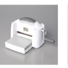
Stampin' Cut & Emboss Machine -149653