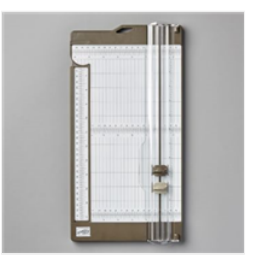
Paper Trimmer -152392