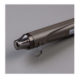
Heat Tool - 129053