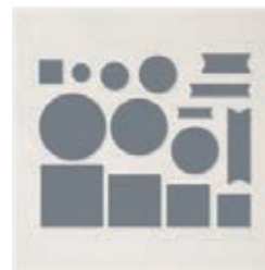
Stylish Shapes Dies - 159183