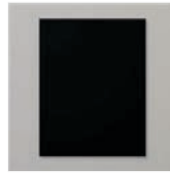
Basic Black 8-1/2" X 11" Cardstock - 121045