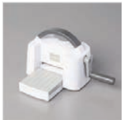
Mini Stampin' Cut & Emboss Machine - 150673