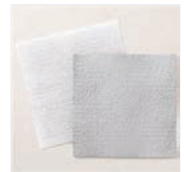
Timeworn Type 3D Embossing Folder - 156505