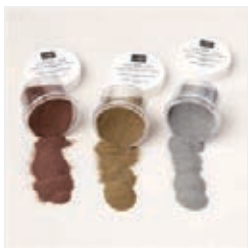
Metallics Embossing Powders - 155555