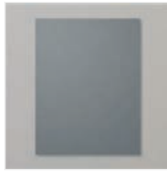
Basic Gray 8-1/2" X 11" Cardstock - 121044