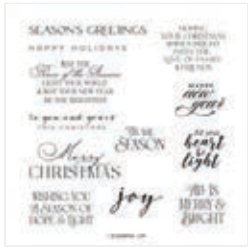
Brightest Glow Cling Stamp Set (English) - 159542

Tami White tami@stampwithtami.com www.stampwithtami.com