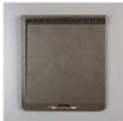
Simply Scored Scoring Tool - 122334