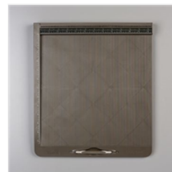
Simply Scored Scoring Tool - 122334