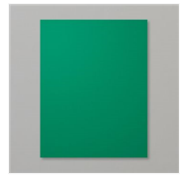
Shaded Spruce 8- 1/2" X 11" Cardstock - 146981