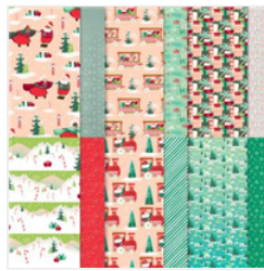
Santa Express 12" X 12" (30.5 X 30.5 Cm) Designer Series Paper - 159582