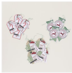
From The North Pole Paper Pumpkin Refill - 161915