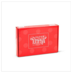
Prepaid Paper Pumpkin Subscription 1- Month - 137858

Tami White tami@stampwithtami.com www.stampwithtami.com