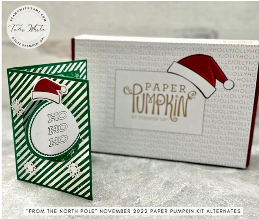
"FROM THE NORTH POLE" NOVEMBER 2022 PAPER PUMPKIN KIT ALTERNATES

See my video for how to make pop out swing fun fold cards.