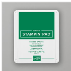
Shaded Spruce Classic Stampin' Pad - 147088