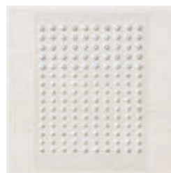
Iridescent Pearl Basic Jewels - 158987