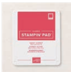
Sweet Sorbet Classic Stampin' Pad - 159216

Tami White tami@stampwithtami.com www.stampwithtami.com