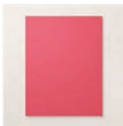
Sweet Sorbet 8- 1/2" X 11" Cardstock - 159268