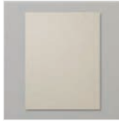
Sahara Sand 8-1/2" X 11" Cardstock - 121043