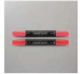
Poppy Parade Stampin' Blends Combo Pack - 154958