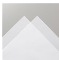
Vellum 8-1/2" X 11" Cardstock - 101856