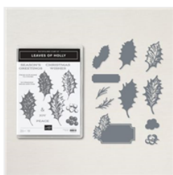
Leaves Of Holly Bundle (English) - 159608

Tami White tami@stampwithtami.com www.stampwithtami.com