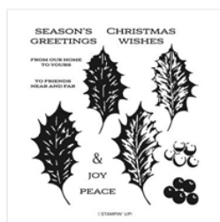
Leaves Of Holly Photopolymer Stamp Set (English) - 159601