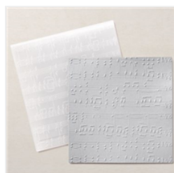
Merry Melody 3D Embossing Folder - 156392