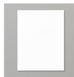
Shimmery White 8- 1/2" X 11" Cardstock - 101910