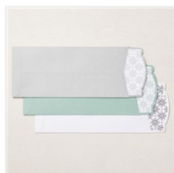
Slimline Envelopes - 157981