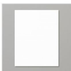
Shimmery White 8- 1/2" X 11" Cardstock - 101910