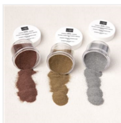
Metallics Embossing Powders - 155555