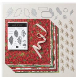
Boughs Of Holly Suite Collection (English) - 159612

Tami White tami@stampwithtami.com www.stampwithtami.com