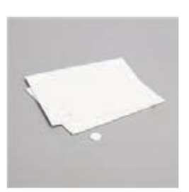
Stampin' Dimensionals -104430