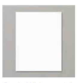
Basic White 8-1/2" X 11" Cardstock -159276