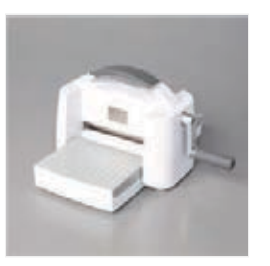
Stampin' Cut & Emboss Machine -149653