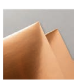
Copper Foil Sheets - 142020