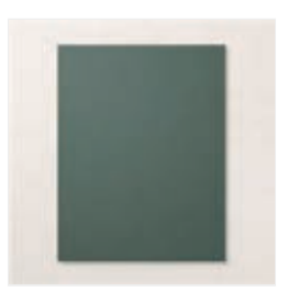
Evening Evergreen 8-1/2" X 11" Cardstock -155574