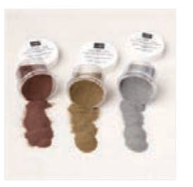
Metallics Embossing Powders - 155555