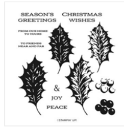
Leaves Of Holly Photopolymer Stamp Set (English) - 159601