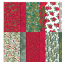
Boughs Of Holly 12" X 12" (30.5 X 30.5 Cm) Designer Series Paper - 159600