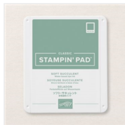
Soft Succulent Classic Stampin' Pad - 155778