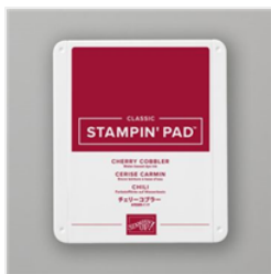
Cherry Cobbler Classic Stampin' Pad - 147083