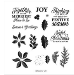
Merriest Moments Photopolymer Stamp Set (English) - 156353