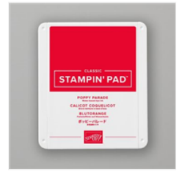
Poppy Parade Classic Stampin' Pad - 147050