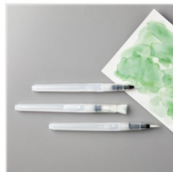
Water Painters - 151298