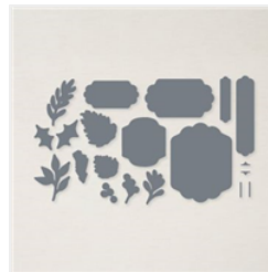
Seasonal Labels Dies - 156299