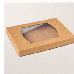
Kraft Gift Boxes - 156569