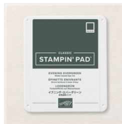
Evening Evergreen Classic Stampin' Pad - 155576