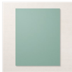
Soft Succulent 8-1/2" X 11" Cardstock - 155776