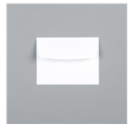
Basic White Medium Envelopes - 159236