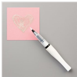
Wink Of Stella Clear Glitter Brush - 141897