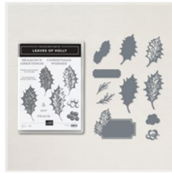
Leaves Of Holly Bundle (English) - 159608