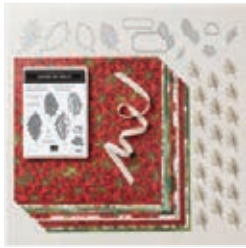
Boughs Of Holly Suite Collection (English) - 159612