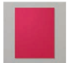
Real Red 8-1/2" X 11" Cardstock - 102482