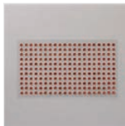
Red Rhinestone Basic Jewels - 146924