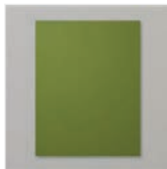
Mossy Meadow 8- 1/2" X 11" Cardstock - 133676