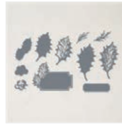
Holly Berry Dies - 159607