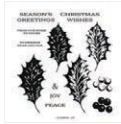
Leaves Of Holly Photopolymer Stamp Set (English) - 159601