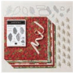
Boughs Of Holly Suite Collection (English) - 159612

Tami White tami@stampwithtami.com www.stampwithtami.com