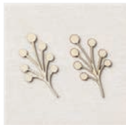
Textural Elements - 159966