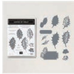
Leaves Of Holly Bundle (English) - 159608