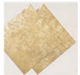
Distressed Gold 12" X 12" (30.5 X 30.5 Cm) Specialty Paper - 159237