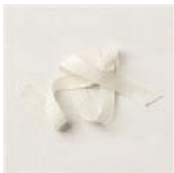
Natural 1/2" (1.3 Cm) Woven Ribbon - 159611