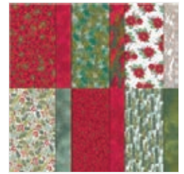
Boughs Of Holly 12" X 12" (30.5 X 30.5 Cm) Designer Series Paper - 159600