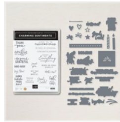
Charming Sentiments Bundle (English) - 158734