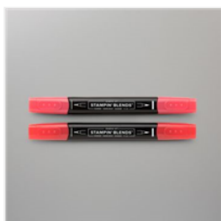
Poppy Parade Stampin' Blends Combo Pack - 154958