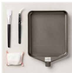
Embossing Additions Tool Kit - 159971