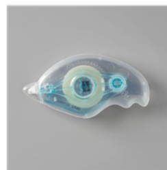
Stampin' Seal - 152813