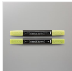
Granny Apple Green Stampin' Blends Combo Pack - 154885