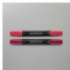
Cherry Cobbler Stampin' Blends Combo Pack - 154880