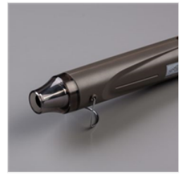
Heat Tool - 129053