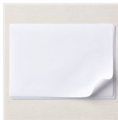
Stampin' Up! Masking Paper - 155480