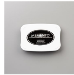
Tuxedo Black Memento Ink Pad - 132708