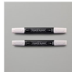
Gray Granite Stampin' Blends Combo Pack - 154886