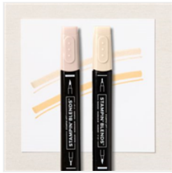
Stampin' Blends Medium Light Combo Pack - 159463

Tami White tami@stampwithtami.com www.stampwithtami.com