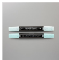
Pool Party Stampin' Blends Combo Pack - 154894