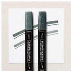
Evening Evergreen Stampin' Blends Combo Pack - 155517