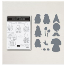
Kindest Gnomes Bundle (English) - 159626