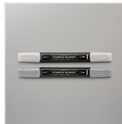
Smoky Slate Stampin' Blends Combo Pack - 154904