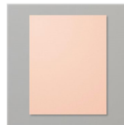
Petal Pink 8-1/2" X 11" Cardstock - 146985