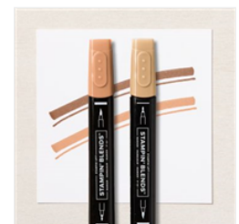
Stampin' Blends Medium Combo - 159462