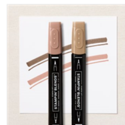
Stampin' Blends Medium Deep Combo - 159461