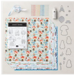
Storybook Gnomes Suite Collection (English) - 159630

Tami White tami@stampwithtami.com www.stampwithtami.com