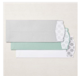
Slimline Envelopes - 157981