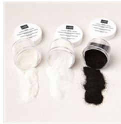
Basics Embossing Powders - 155554