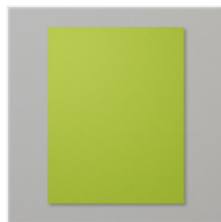
Granny Apple Green 8-1/2" X 11" Cardstock - 146990