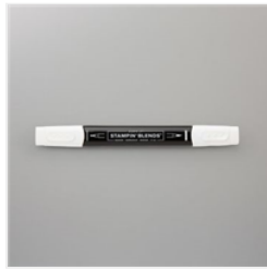
Stampin' Blends Color Lifter - 144608