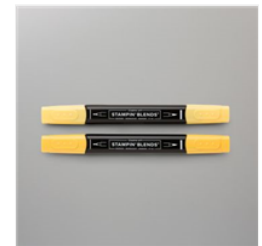
Daffodil Delight Stampin' Blends Combo Pack - 154883