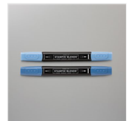
Night Of Navy Stampin' Blends Combo Pack - 154891