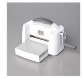
Stampin' Cut & Emboss Machine -149653