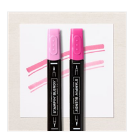
Polished Pink Stampin' Blends Combo Pack -155520