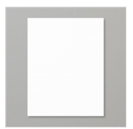
Shimmery White 8-1/2" X 11" Cardstock -101910