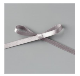
Gray Granite 1/4" (6.4 Mm) Shimmer Ribbon - 152463