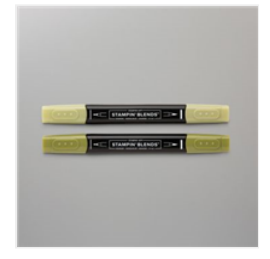
Old Olive Stampin' Blends Combo Pack - 154892