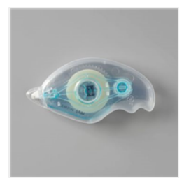
Stampin' Seal -152813