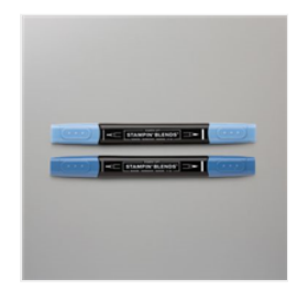
Night Of Navy Stampin' Blends Combo Pack -154891