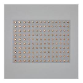
Champagne Rhinestone Basic Jewels - 151193