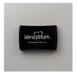
Versamark Pad -102283