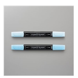
Balmy Blue Stampin' Blends Combo Pack -154830