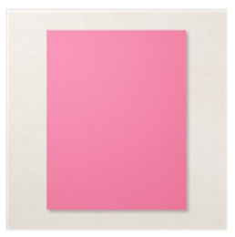
Polished Pink 8-1/2" X 11" Cardstock -155710