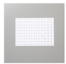
Rhinestone Basic Jewels - 144220