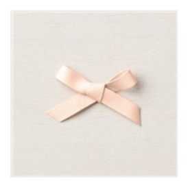
Petal Pink 3/8" (1 Cm) Soft Polyester Ribbon - 159192