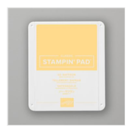
So Saffron Classic Stampin' Pad -147109