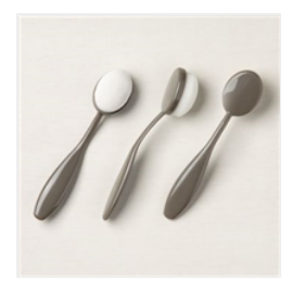
Blending Brushes - 153611