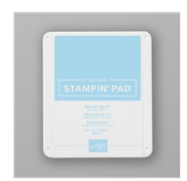
Balmy Blue Classic Stampin' Pad -147105