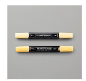
So Saffron Stampin' Blends Combo Pack -154905