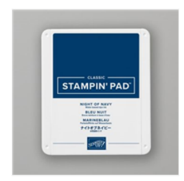
Night Of Navy Classic Stampin' Pad - 147110