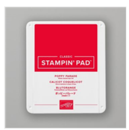
Poppy Parade Classic Stampin' Pad - 147050