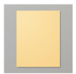
So Saffron 8-1/2" X 11" Cardstock -105118