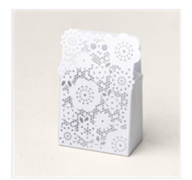
Delicate Details Treat Boxes -159248