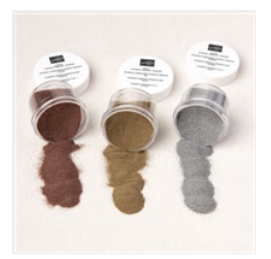
Metallics Embossing Powders - 155555