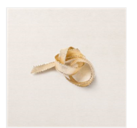
Gold 3/8" (1 Cm) Shimmer Ribbon -156470