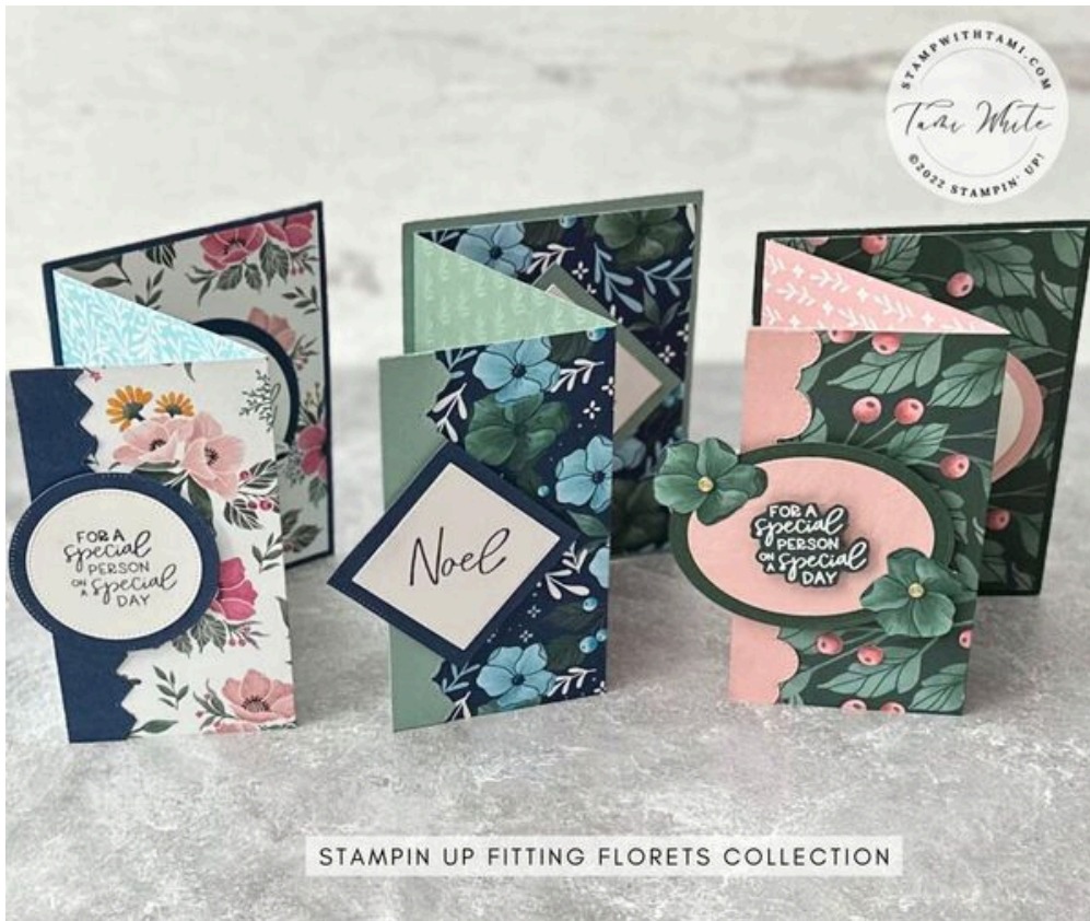
STAMPIN UP FITTING FLORETS COLLECTION