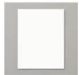
Shimmery White 8-1/2" X 11" Cardstock - 101910