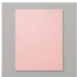
Blushing Bride 8-1/2" X 11" Cardstock - 131198