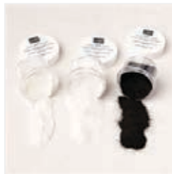
Basics Embossing Powders - 155554