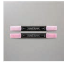
Flirty Flamingo Stampin' Blends Combo Pack - 154884