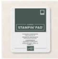
Evening Evergreen Classic Stampin' Pad - 155576