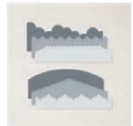
Basic Borders Dies - 155558