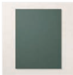
Evening Evergreen 8-1/2" X 11" Cardstock - 155574