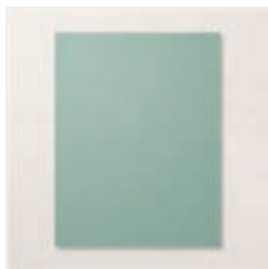
Soft Succulent 8-1/2" X 11" Cardstock - 155776