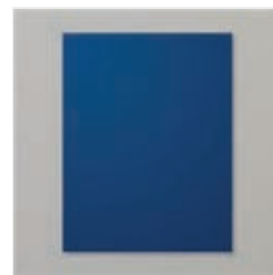
Night of Navy 8-1/2" X 11" Cardstock - 100867