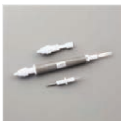
Take Your Pick - 144107