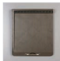
Simply Scored Scoring Tool - 122334