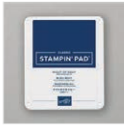
Night of Navy Classic Stampin' Pad - 147110