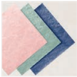
Brushstroke 12" X 12" (30.5 X 30.5 Cm) Specialty Paper - 159250

Tami White tami@stampwithtami.com www.stampwithtami.com