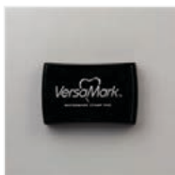
Versamark Pad - 102283