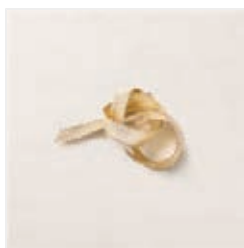
Gold 3/8" (1 Cm) Shimmer Ribbon - 156470