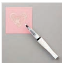
Wink Of Stella Clear Glitter Brush - 141897