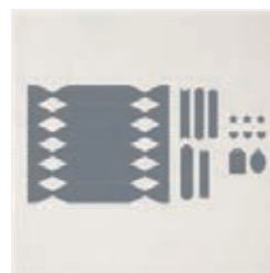
Cracker & Treat Box Dies - 159182