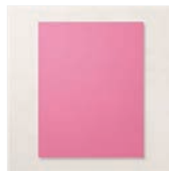
Polished Pink 8- 1/2" X 11" Cardstock - 155710