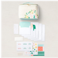
Nourish & Flourish Kit - 160230

Tami White tami@stampwithtami.com www.stampwithtami.com