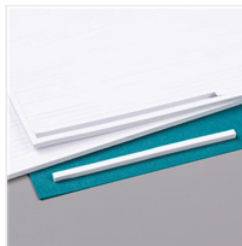
Foam Adhesive Strips - 141825