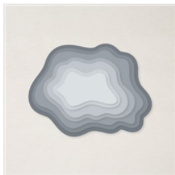
Layering Diorama Dies - 155565