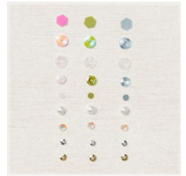
For Everything Fancy Sequins - 159187