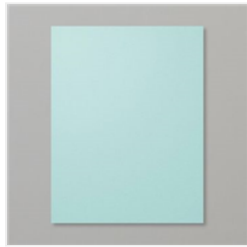
Pool Party 8-1/2" X 11" Cardstock - 122924