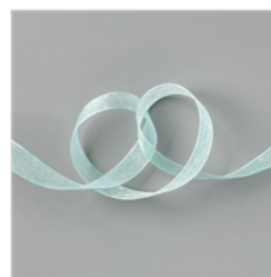
Pool Party 3/8" (1 Cm) Sheer Ribbon - 152462