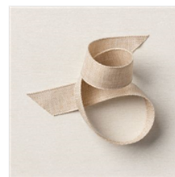
Natural Finish 7/8" (2.2 Cm) Ribbon - 159051