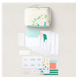
Nourish & Flourish Kit - 160230