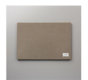
Stampin' Pierce Mat - 126199