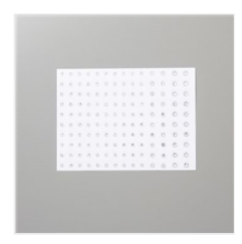
Rhinestone Basic Jewels - 144220