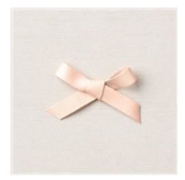
Petal Pink 3/8" (1 Cm) Soft Polyester Ribbon - 159192