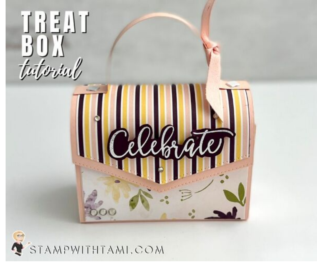
Box #6 in my Treat Box Series. See video for how to do create this.