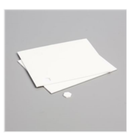
Stampin' Dimensionals -104430