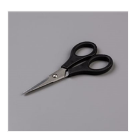
Paper Snips Scissors - 103579