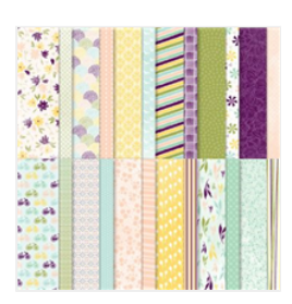
Design A Daydream 12" X 12" (30.5 X 30.5 Cm) Host Designer Series Paper 159161