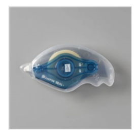
Stampin' Seal+ -149699