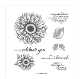
Celebrate Sunflowers Cling Stamp Set (English) - 152517