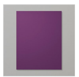
Blackberry Bliss 8-1/2" X 11" Cardstock -133675