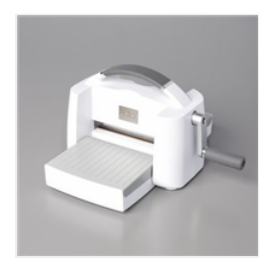
Stampin' Cut & Emboss Machine -149653