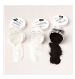
Basics Embossing Powders - 155554