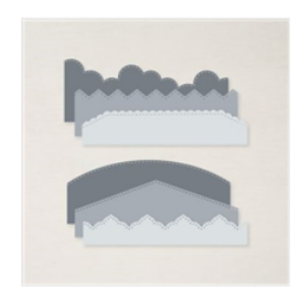
Basic Borders Dies - 155558