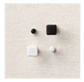
Round & Square Brads - 155570