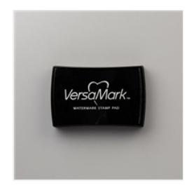
Versamark Pad -102283