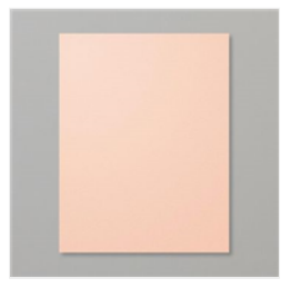
Petal Pink 8-1/2" X 11" Cardstock -146985