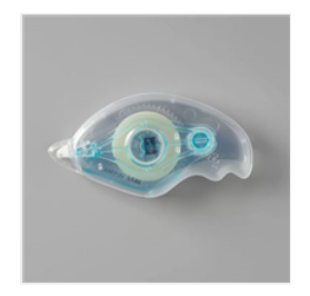
Stampin' Seal -152813

Tami White tami@stampwithtami.com www.stampwithtami.com