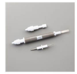
Take Your Pick -144107