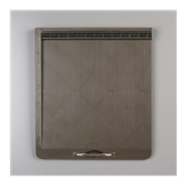
Simply Scored Scoring Tool -122334