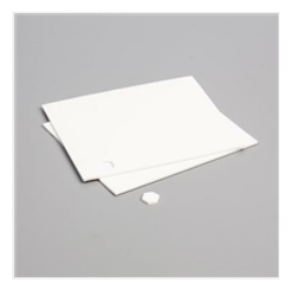
Stampin' Dimensionals -104430