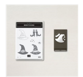
Bewitching Bundle (English) - 159857