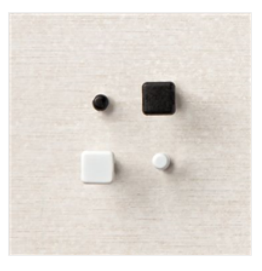
Round & Square Brads - 155570