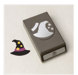
Witch Hat Builder Punch - 159856