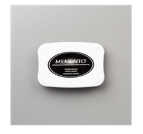
Tuxedo Black Memento Ink Pad -132708