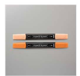
Pumpkin Pie Stampin' Blends Combo Pack -154897