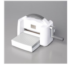
Stampin' Cut & Emboss Machine -149653