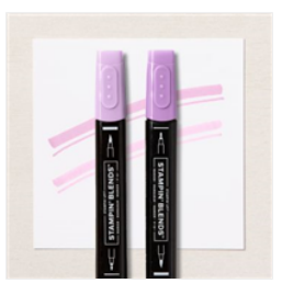
Fresh Freesia Stampin' Blends Combo Pack -155518