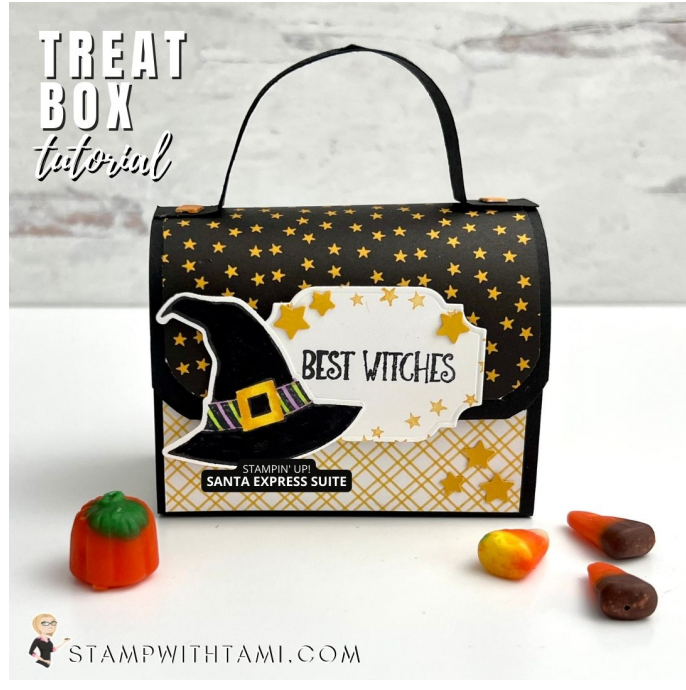
Box #5 in my Treat Box Series. See video for how to do create this.