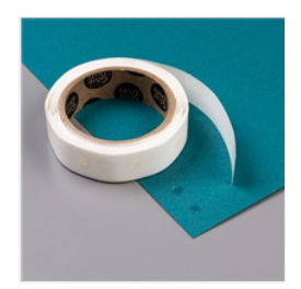
Mini Glue Dots -103683