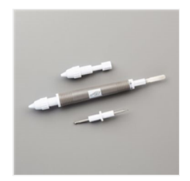
Take Your Pick - 144107