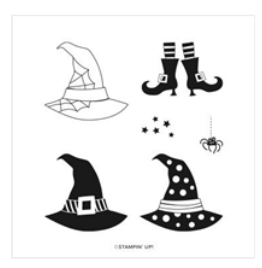
Bewitching Cling Stamp Set (English) - 159855