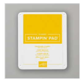
Crushed Curry Classic Stampin' Pad - 147087