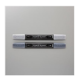
Basic Black Stampin' Blends Combo Pack -154843