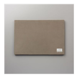
Stampin' Pierce Mat - 126199