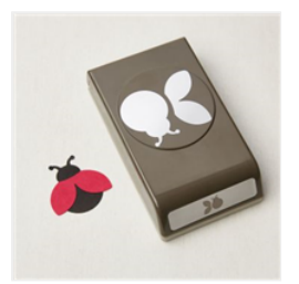
Ladybug Builder Punch - 157698