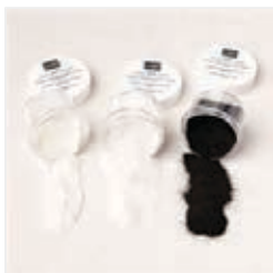
Basics Embossing Powders - 155554