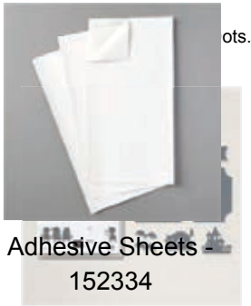
Adhesive Sheets - 152334

Tami White tami@stampwithtami.com www.stampwithtami.com