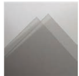
Window Sheets - 142314