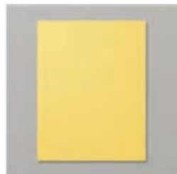
Daffodil Delight 8- 1/2" X 11" Cardstock - 119683