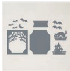
Scary Silhouettes Dies - 159851