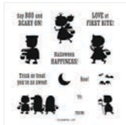
Scary Cute Cling Stamp Set (English) - 159850