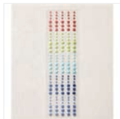
2022-2024 In Color Matte Decorative Dots - 159186