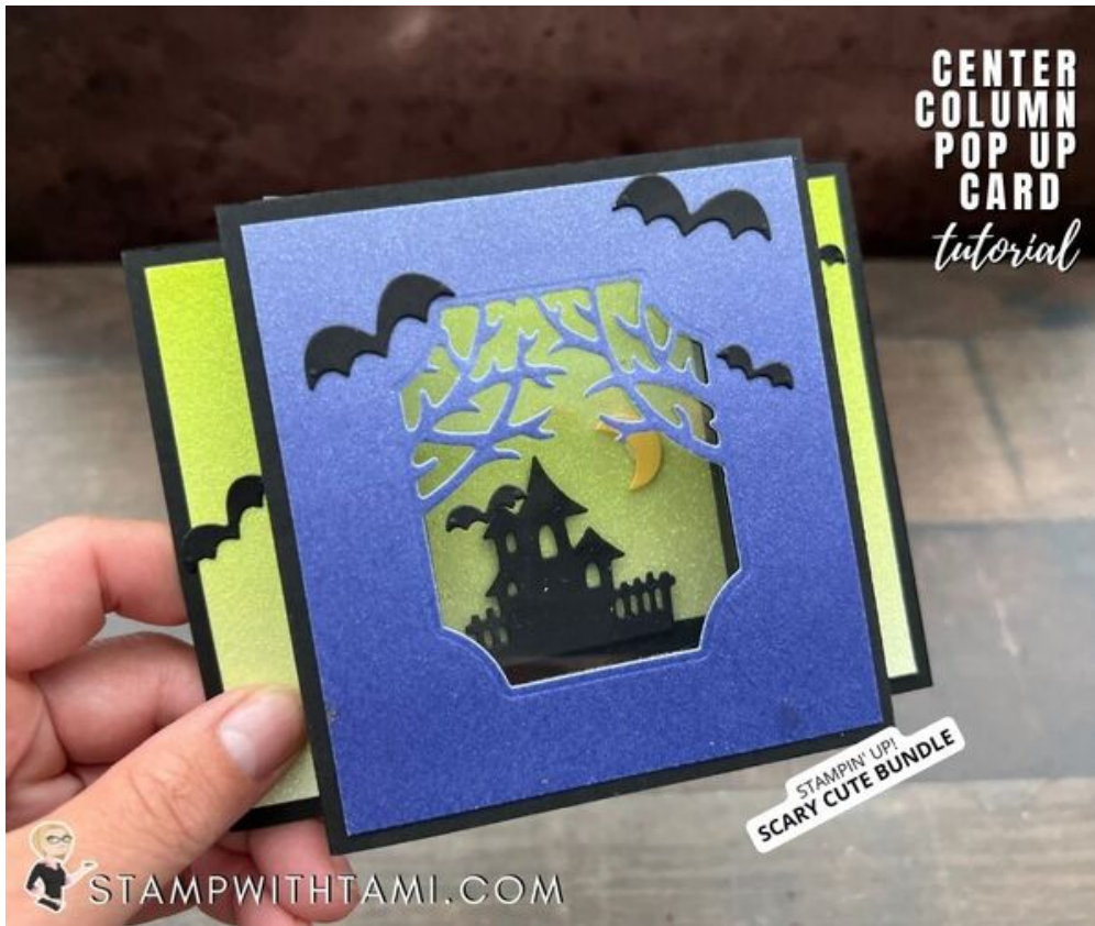
Card 8 in my Center Column Pop Up Fun Fold Series. See video for how to do this fold.