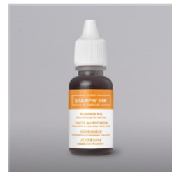
Pumpkin Pie Classic Stampin' Ink Refill - 105229