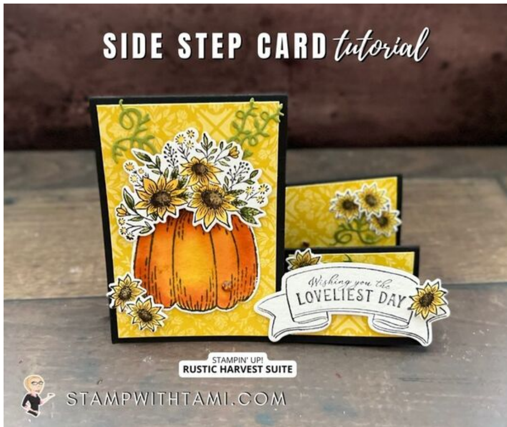
Card 5 in my Side Step Series. See template and video for how to do this fold.

Tami White tami@stampwithtami.com www.stampwithtami.com