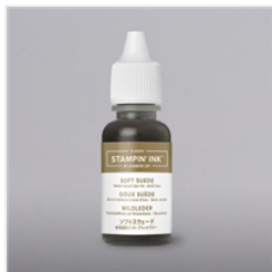
Soft Suede Classic Stampin' Ink Refill - 115663