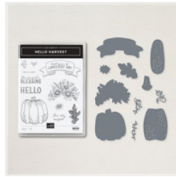
Hello Harvest Bundle (English) - 159644