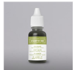
Old Olive Classic Stampin' Ink Refill - 100531