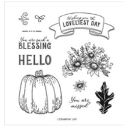
Hello Harvest Cling Stamp Set (English) - 159634