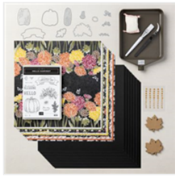
Rustic Harvest Suite Collection (English) - 159648

Tami White tami@stampwithtami.com www.stampwithtami.com