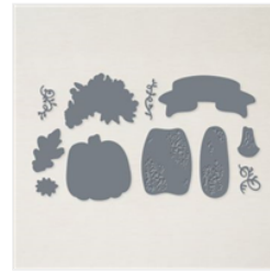
Rustic Pumpkin Dies - 159643