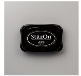
Jet Black Stazon Pad - 101406