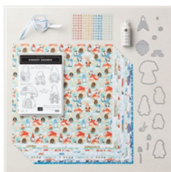
Storybook Gnomes Suite Collection (English) - 159630

Tami White tami@stampwithtami.com www.stampwithtami.com