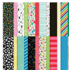
Celebrate Everything 12" X 12" (30.5 X 30.5 Cm) Designer Series Paper - 159913