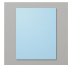
Balmy Blue 8-1/2" X 11" Cardstock - 146982