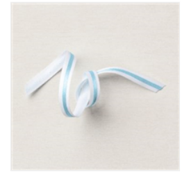
Balmy Blue & White 3/8" Double-Stitched Ribbon - 159629