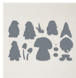
Gnomes Dies - 159625