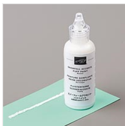
Snowfall Accents Puff Paint - 150691