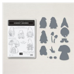
Kindest Gnomes Bundle (English) - 159626