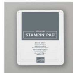
Basic Gray Classic Stampin' Pad - 149165