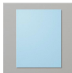
Balmy Blue 8-1/2" X 11" Cardstock - 146982