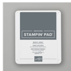
Basic Gray Classic Stampin' Pad - 149165