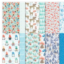
Storybook Gnomes 12" X 12" (30.5 X 30.5 Cm) Designer Series Paper - 159615