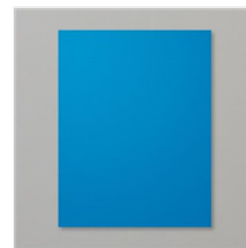
Pacific Point 8-1/2" X 11" Cardstock - 111350