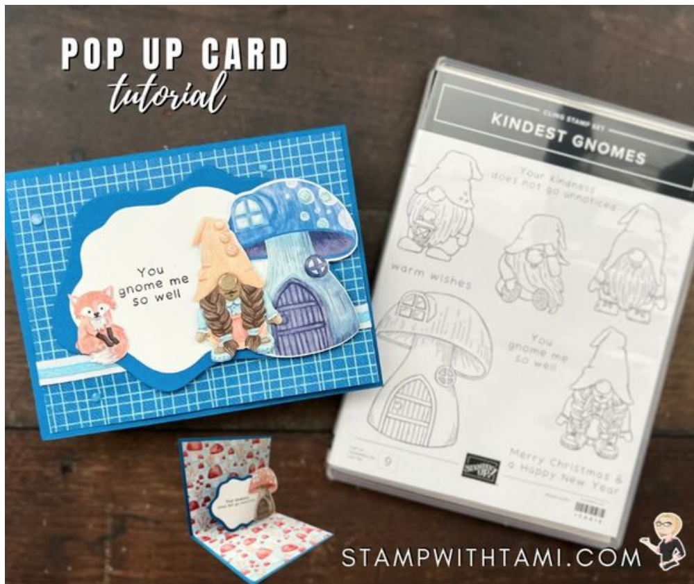
Card 12 in my Pop Up Series. See video for how to make pop up cards.

Tami White tami@stampwithtami.com www.stampwithtami.com