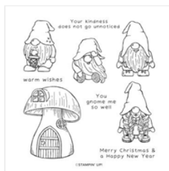
Kindest Gnomes Cling Stamp Set (English) - 159616