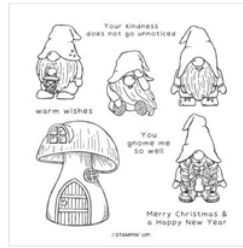
Kindest Gnomes Cling Stamp Set (English) - 159616