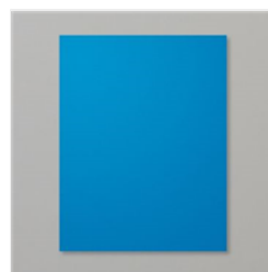
Pacific Point 8-1/2" X 11" Cardstock - 111350