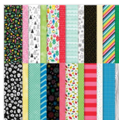
Celebrate Everything 12" X 12" (30.5 X 30.5 Cm) Designer Series Paper - 159913