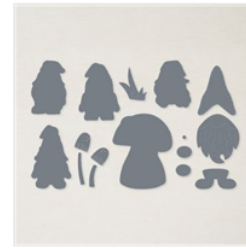
Gnomes Dies - 159625