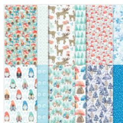
Storybook Gnomes 12" X 12" (30.5 X 30.5 Cm) Designer Series Paper - 159615