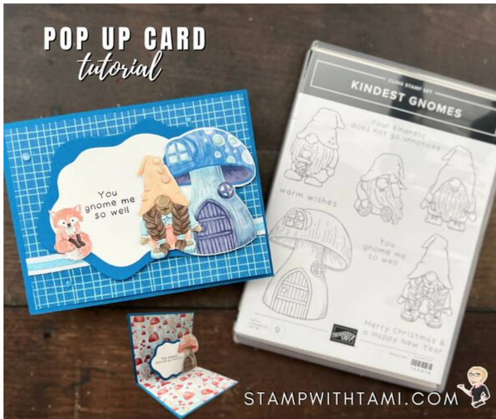
Card 12 in my Pop Up Series. See video for how to make pop up cards.