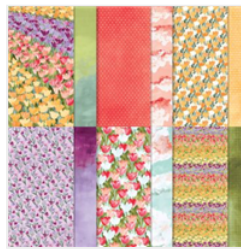
Flowering Fields 12" X 12" (30.5 X 30.5 Cm) Designer Series Paper - 157670