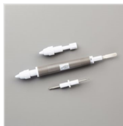
Take Your Pick - 144107