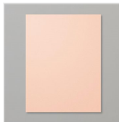
Petal Pink 8-1/2" X 11" Cardstock - 146985