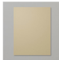
Crumb Cake 8-1/2" X 11" Cardstock - 120953