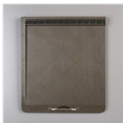
Simply Scored Scoring Tool - 122334