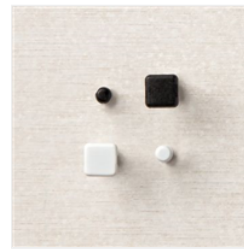
Round & Square Brads - 155570