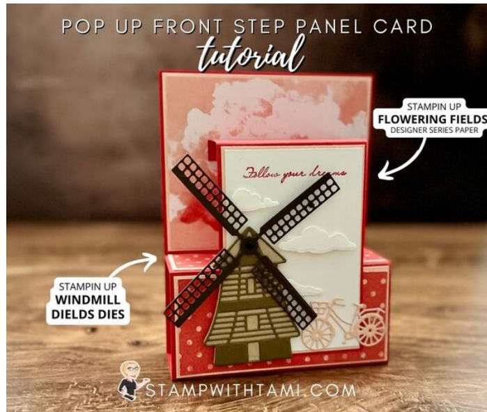
CARD #12 IN MY POP UP FRONT STEP PANEL FUN FOLD SERIES.

Tami White tami@stampwithtami.com www.stampwithtami.com