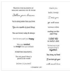
Through It Together Cling Stamp Set (English) - 155796

Tami White tami@stampwithtami.com www.stampwithtami.com