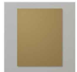
Soft Suede 8-1/2" X 11" Cardstock - 115318