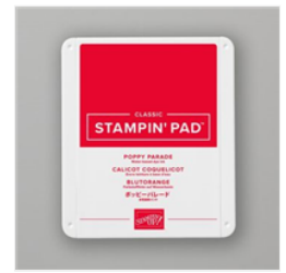
Poppy Parade Classic Stampin' Pad - 147050