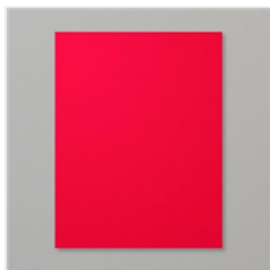
Poppy Parade 8-1/2" X 11" Cardstock - 119793