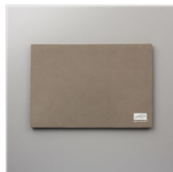
Stampin' Pierce Mat - 126199