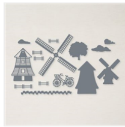
Windmill Fields Dies - 157683