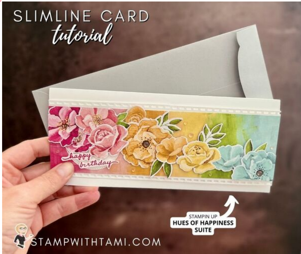
Card 8 of my Hues of Happiness Suite Series. Cased from Stesha Bloodhart. Visit my blog for more in this series.