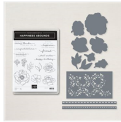
Happiness Abounds Bundle (English) - 158824