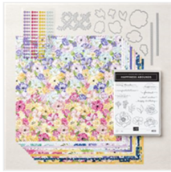
Hues Of Happiness Suite Collection (English) - 158828

Tami White tami@stampwithtami.com www.stampwithtami.com