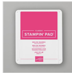
Melon Mambo Classic Stampin' Pad - 147051