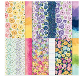
Hues Of Happiness 12" X 12" (30.5 X 30.5 Cm) Designer Series Paper - 158822