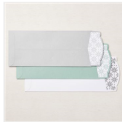
Slimline Envelopes - 157981