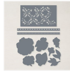
Blossoming Happiness Dies - 158823