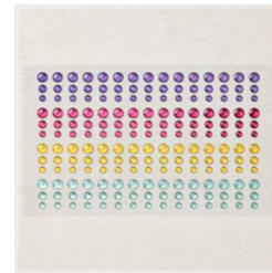
Glossy Dots Assortment - 158827