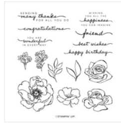
Happiness Abounds Photopolymer Stamp Set (English) - 159238