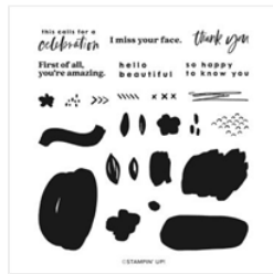
Hello Beautiful Photopolymer Stamp Set (English) - 158041