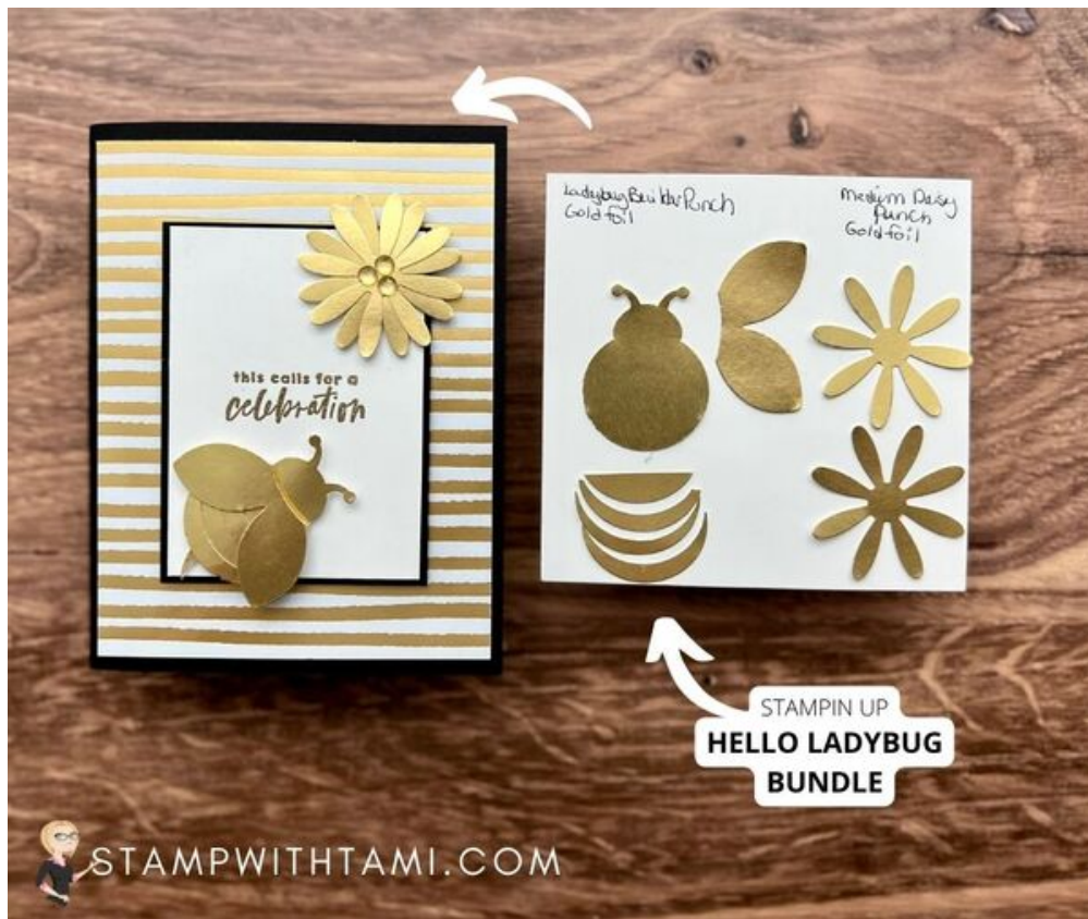
GOLD FOIL BUMBLEBEE - CARD #4 IN MY LADYBUG SERIES.