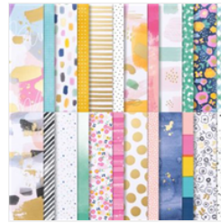
Abstract Beauty 4" X 6" (10.2 X 15.2 Cm) Specialty Designer Series Paper - 158039