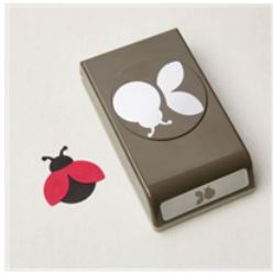
Ladybug Builder Punch - 157698

Tami White tami@stampwithtami.com www.stampwithtami.com