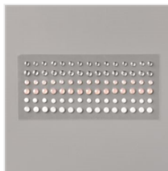
Elegant Faceted Gems - 152464