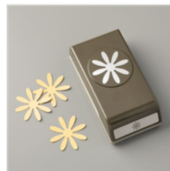
Medium Daisy Punch - 149517