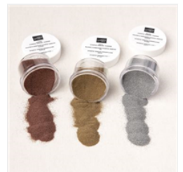
Metallics Embossing Powders - 155555