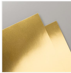
Gold Foil Sheets - 132622