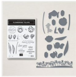
Flowering Tulips Bundle (English) - 157678