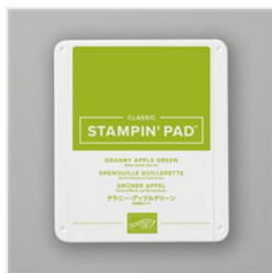
Granny Apple Green Classic Stampin' Pad - 147095