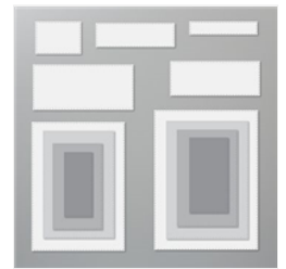
Rectangle Stitched Dies - 151820