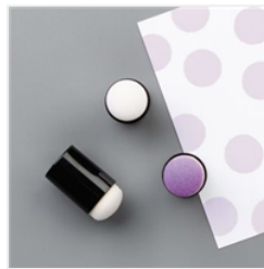
Sponge Daubers - 133773