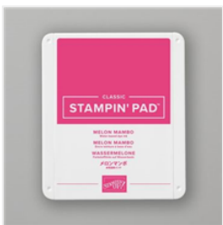
Melon Mambo Classic Stampin' Pad - 147051