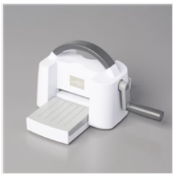
Mini Stampin' Cut & Emboss Machine - 150673