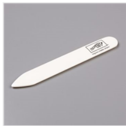
Bone Folder - 102300