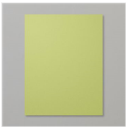
Pear Pizzazz 8-1/2" X 11" Cardstock - 131201