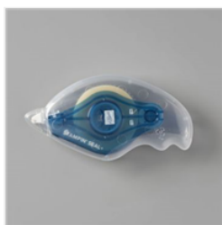
Stampin' Seal+ - 149699

Tami White tami@stampwithtami.com www.stampwithtami.com