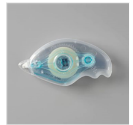
Stampin' Seal - 152813