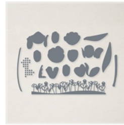
Tulips Dies - 157677