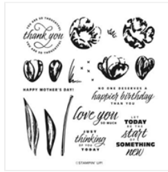
Flowering Tulips Photopolymer Stamp Set (English) - 157672