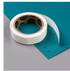
Mini Glue Dots - 103683