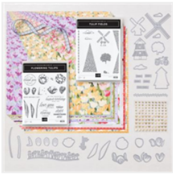
Flowering Fields Suite Collection (English) - 157685

Tami White tami@stampwithtami.com www.stampwithtami.com