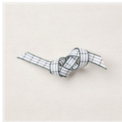
Evening Evergreen 3/8" (1 Cm) Windowpane Check Ribbon - 158135