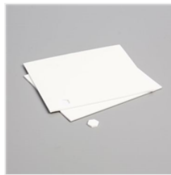
Stampin' Dimensionals - 104430