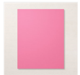
Polished Pink 8-1/2" X 11" Cardstock - 155710