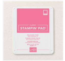
Polished Pink Classic Stampin' Pad - 155712