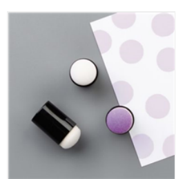
Sponge Daubers -133773