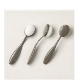
Blending Brushes -153611