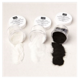
Basics Embossing Powders - 155554