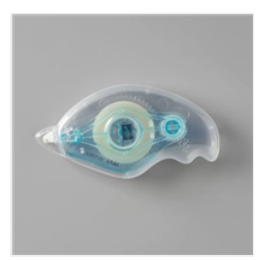
Stampin' Seal -152813

Tami White tami@stampwithtami.com www.stampwithtami.com