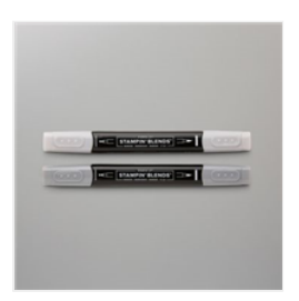
Smoky Slate Stampin' Blends Combo Pack -154904