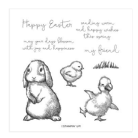
Easter Friends Cling Stamp Set (English) - 157737