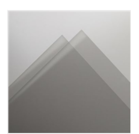
Window Sheets - 142314