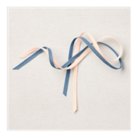
1/8" (3.2 Mm) Cotton Ribbon Combo Pack -158140