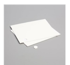
Stampin' Dimensionals -104430