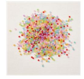
Frosted Beads Assortment -158132