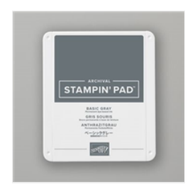
Basic Gray Classic Stampin' Pad -149165