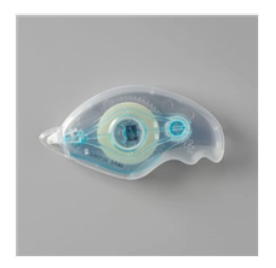
Stampin' Seal -152813