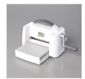
Stampin' Cut & Emboss Machine -149653