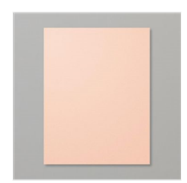
Petal Pink 8-1/2" X 11" Cardstock -146985