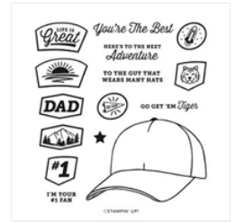
Hats Off Photopolymer Stamp Set - 155483