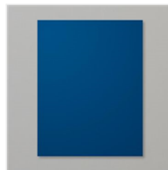
Night Of Navy 8-1/2" X 11" Cardstock - 100867