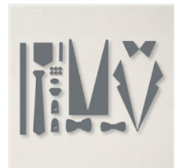
Suit & Tie Dies - 154322