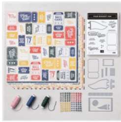
Hey Sports Fan-Suite Collection (English) - 157896

Tami White tami@stampwithtami.com www.stampwithtami.com