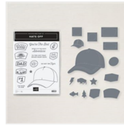
Hats Off Bundle - 158361