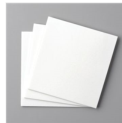
Foam Adhesive Sheets - 152815