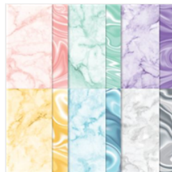
Simply Marbleous 6" X 6" (15.2 X 15.2 Cm) Designer Series Paper - 158128