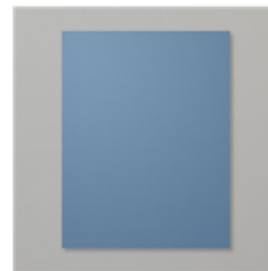
Misty Moonlight 8- 1/2" X 11" Cardstock - 153081