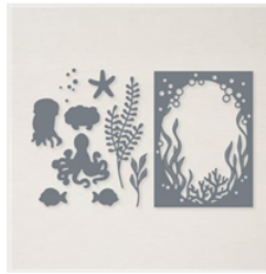
Sea Dies - 157857