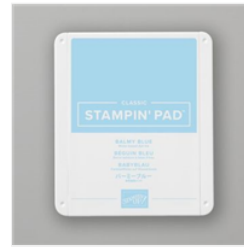
Balmy Blue Classic Stampin' Pad - 147105