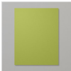
Old Olive 8-1/2" X 11" Cardstock - 100702