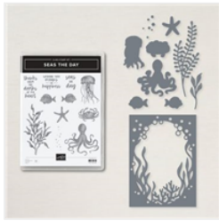
Seas The Day Bundle (English) - 157858

Tami White tami@stampwithtami.com www.stampwithtami.com