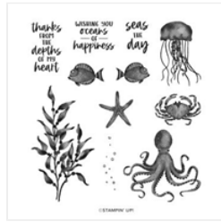
Seas The Day Cling Stamp Set (English) - 157849