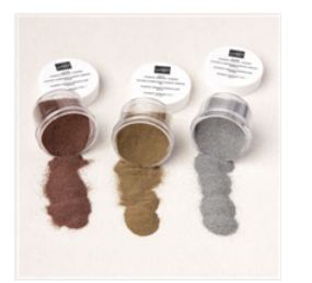
Metallics Embossing Powders - 155555

Tami White tami@stampwithtami.com www.stampwithtami.com