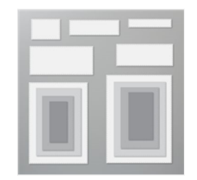
Rectangle Stitched Dies - 151820