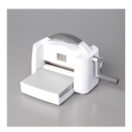
Stampin' Cut & Emboss Machine -149653