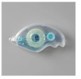
Stampin' Seal -152813