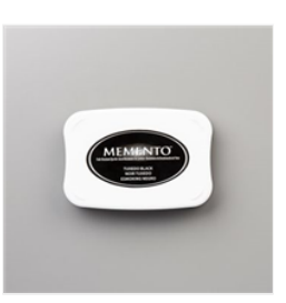
Tuxedo Black Memento Ink Pad -132708