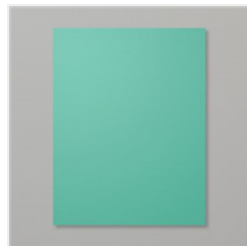
Just Jade 8-1/2" X 11" Cardstock - 153079