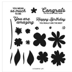
In Bloom Photopolymer Stamp Set (English) - 158218