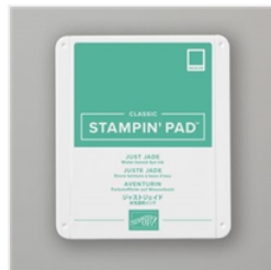
Just Jade Classic Stampin' Pad - 153115