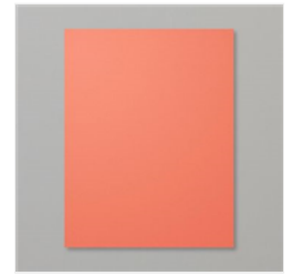
Calypso Coral 8- 1/2" X 11" Cardstock - 122925