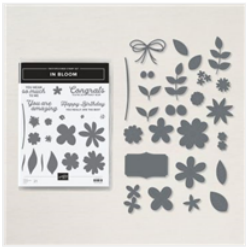
In Bloom Bundle (English) - 156208