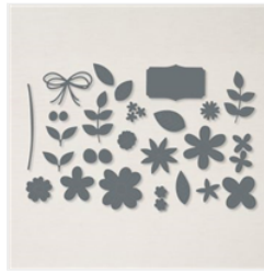
Pierced Blooms Dies - 154312