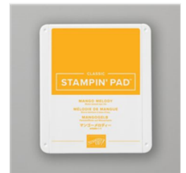
Mango Melody Classic Stampin' Pad - 147093