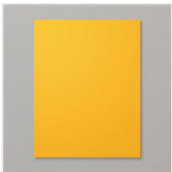
Mango Melody 8- 1/2" X 11" Cardstock - 146989