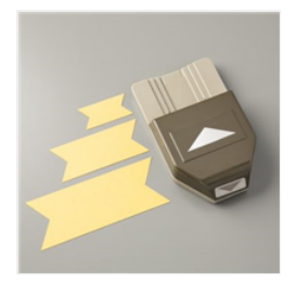
<u>Triple Banner</u> <u>Punch - 138292</u>