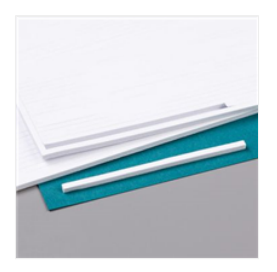
Foam Adhesive Strips - 141825