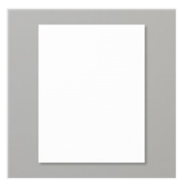
Shimmery White 8-1/2" X 11" Cardstock -101910