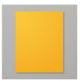
Mango Melody 8-1/2" X 11" Cardstock -146989