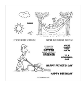
A Cut Above Cling Stamp Set -154448