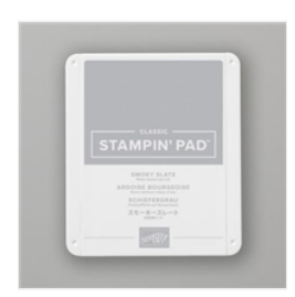
Smoky Slate Classic Stampin' Pad - 147113