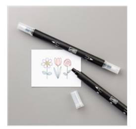
Blender Pens - 102845