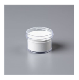
White Stampin' Emboss Powder 109132