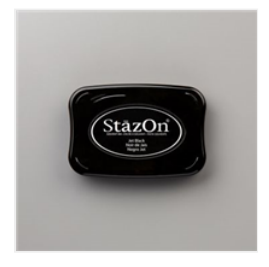
<u>Jet Black Stazon</u> <u>Pad - 101406</u>