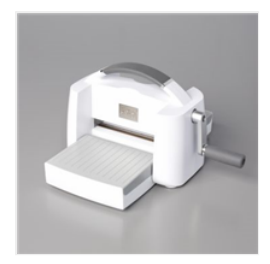
Stampin' Cut & Emboss Machine -149653