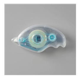
<u>Stampin' Seal -</u> <u>152813</u>