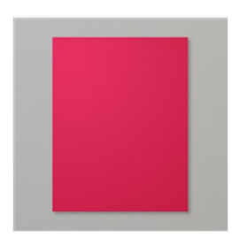
Real Red 8-1/2" X 11" Cardstock -102482