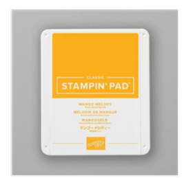
Mango Melody Classic Stampin' Pad - 147093