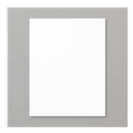
<u>Basic White 8-1/2"</u> <u>X 11" Cardstock -</u> <u>159276</u>