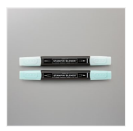
Pool Party Stampin' Blends Combo Pack 154894