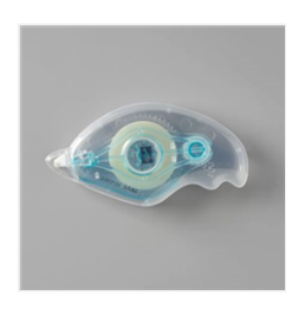
<u>Stampin' Seal -</u> <u>152813</u>