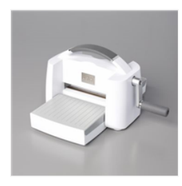
Stampin' Cut & Emboss Machine -149653