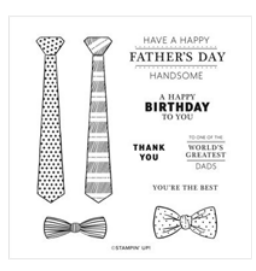
<u>Handsomely</u> <u>Suited Cling Stamp</u> Set - 154444