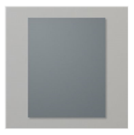
Basic Gray 8-1/2" X 11" Cardstock -121044