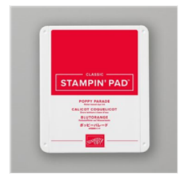
Poppy Parade Classic Stampin' Pad - 147050