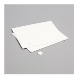
Stampin' Dimensionals 104430