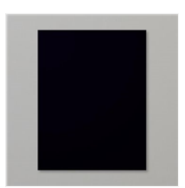
<u>X 11" Cardstock - 121045</u>