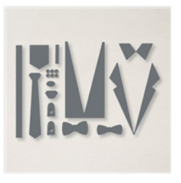
<u>Suit & Tie Dies -</u> <u>154322</u>