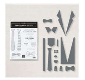
Handsomely Suited Bundle (English) - 156240