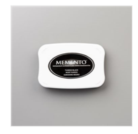
<u>Tuxedo Black</u> <u>Memento Ink Pad -</u> <u>132708</u>